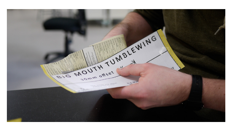
4. Use scissors to carefully cut along both long outside edges.