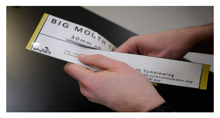
5. Cut carefully down the centre line.