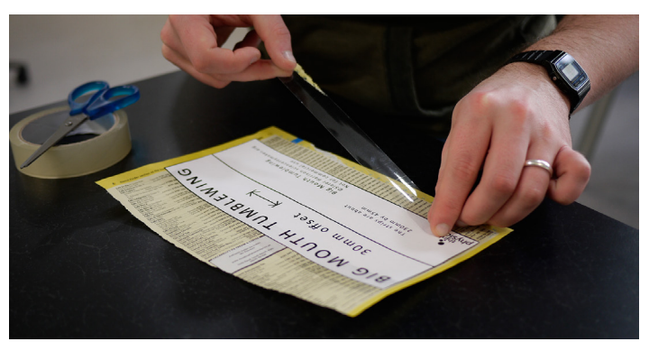
3. Sellotape the four edges of the template to your page from the phone directory.