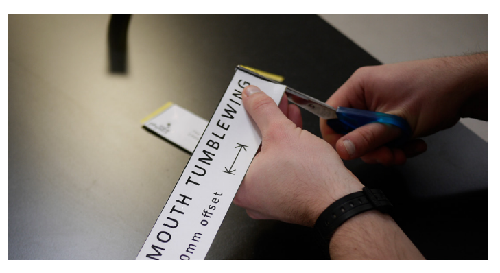
6. Cut off the four ends.