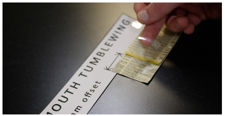
8. Once lined up, use a small piece of sellotape to join the two sections. Turn over and repeat on the opposite end.

For more activities and resources visit our website at thinkphysics.org Big Mouth Tumblewings ©Slater Harrison sciencetoymaker.org