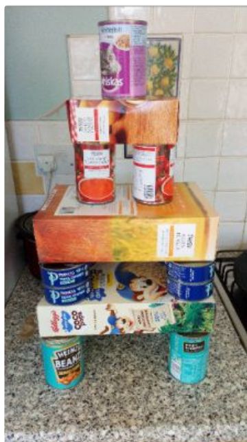
A house built from tins and food packets.

If building isn't your thing, then you could draw your dream house instead.