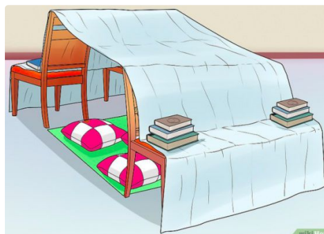
An example blanket house from WikiHow .